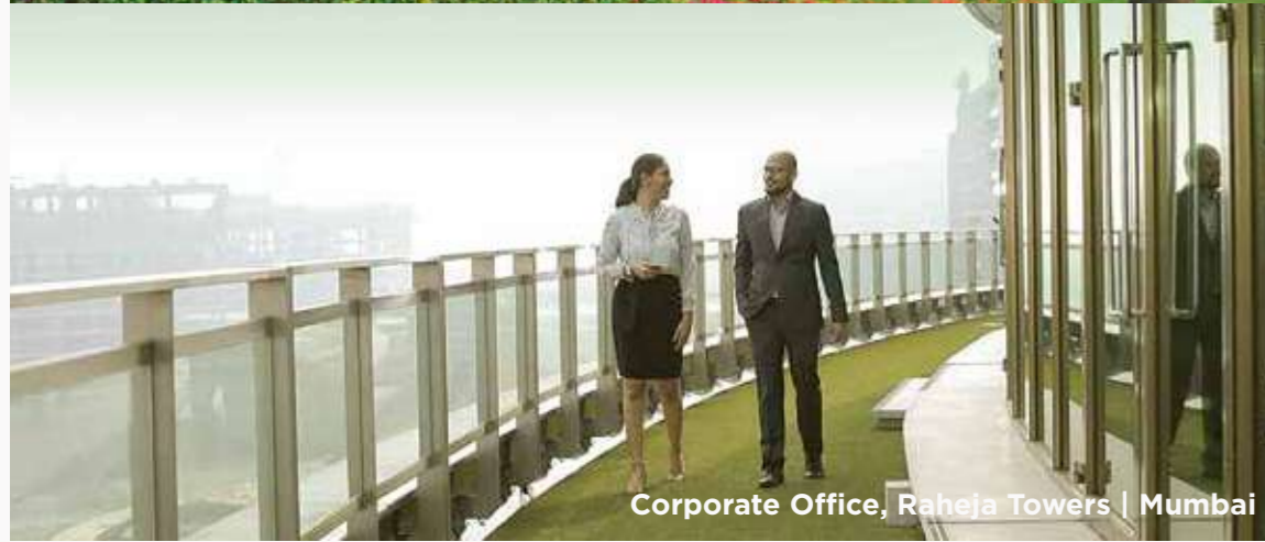
Corporate Office, Raheja Towers | Mumbai