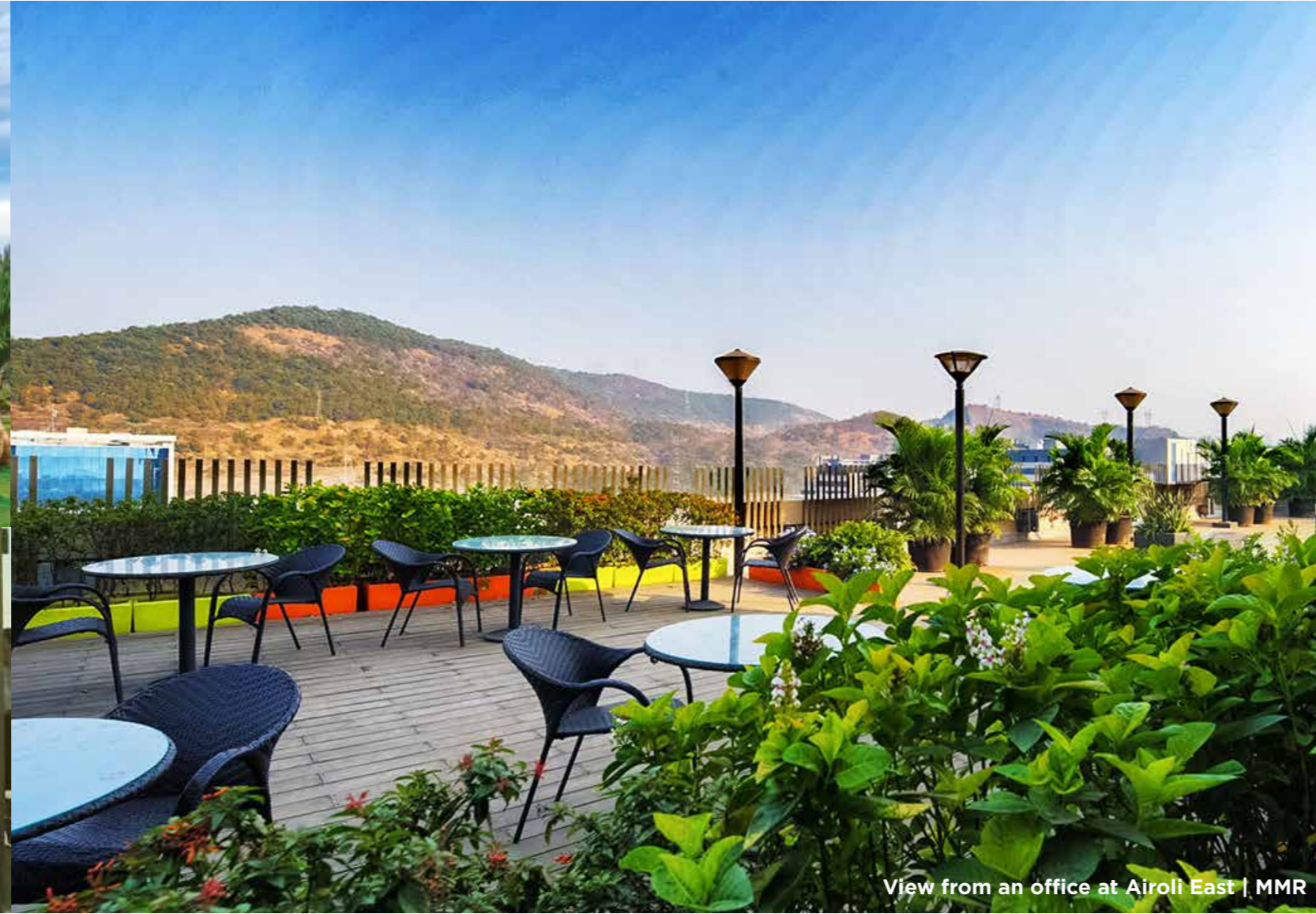
View from an office at Airoli East | MMR