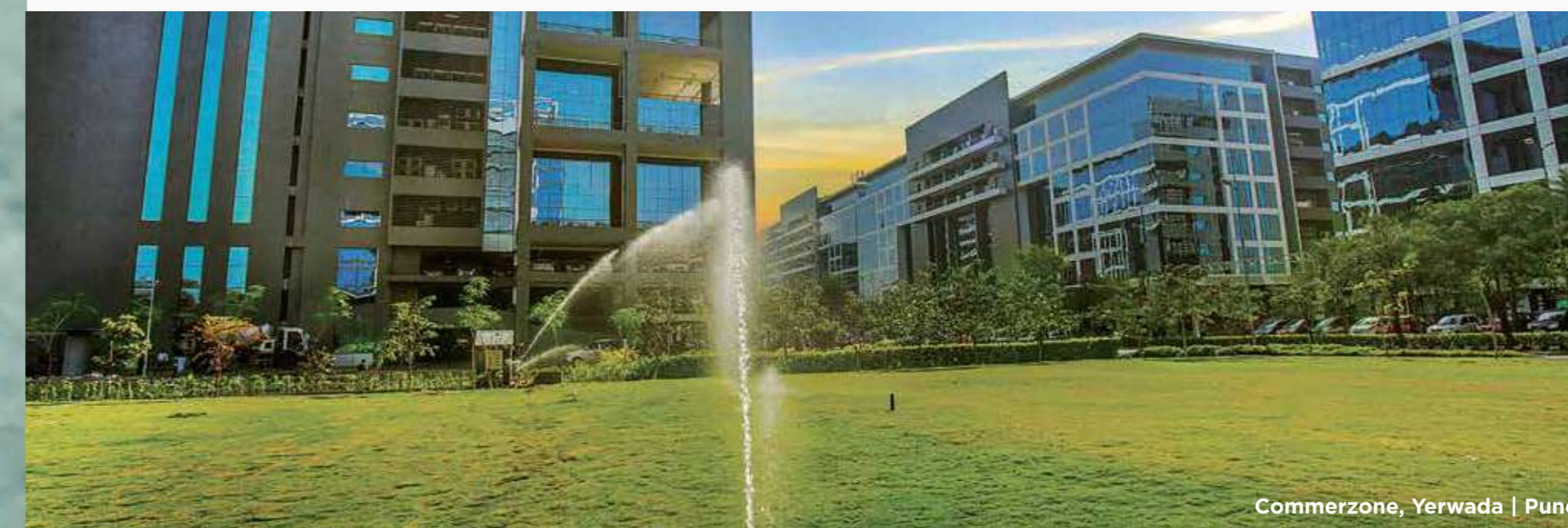
Commerzone, Yerwada | Pune