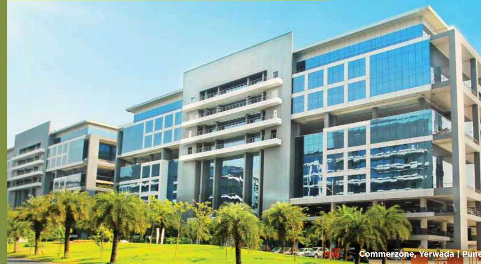
Commerzone, Yerwada | Pune