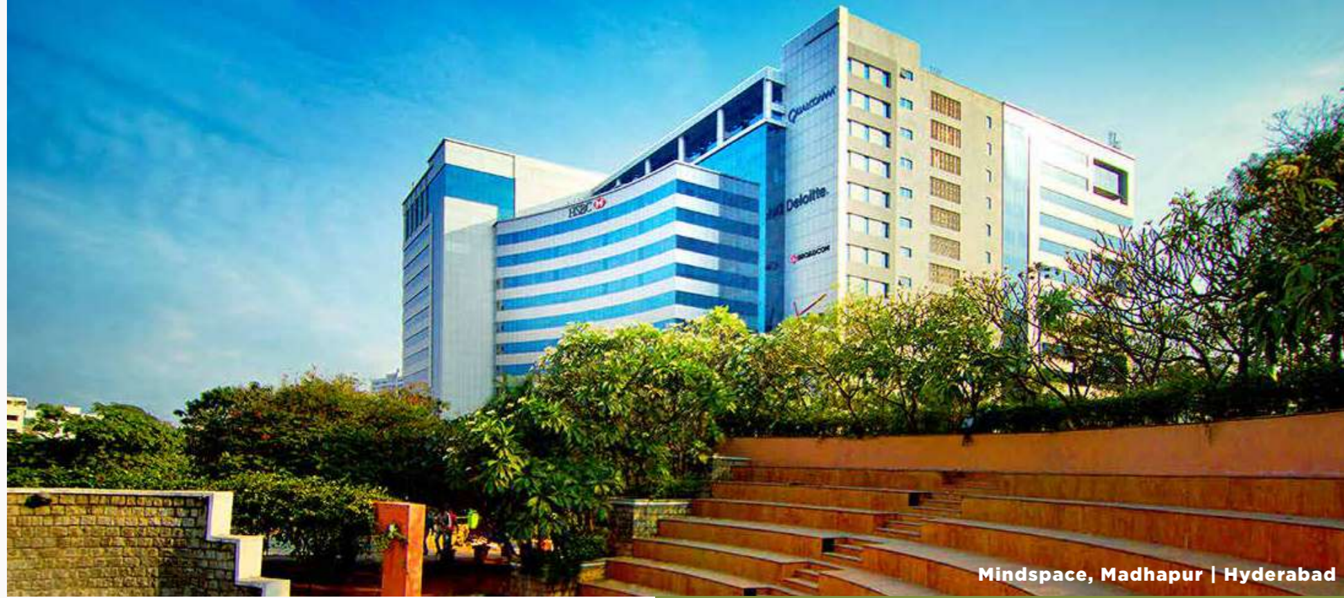
Mindspace, Madhapur | Hyderabad