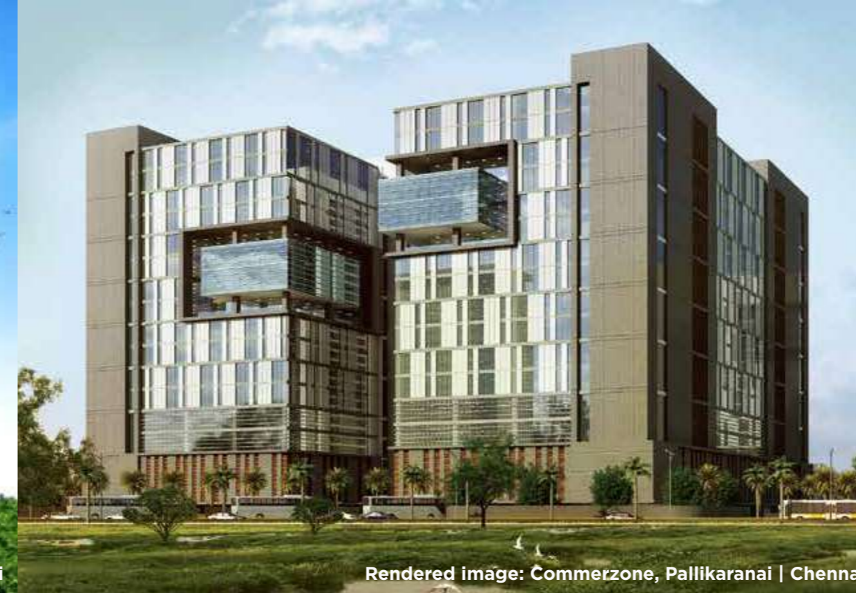
Rendered image: Commerzone, Pallikaranai | Chennai