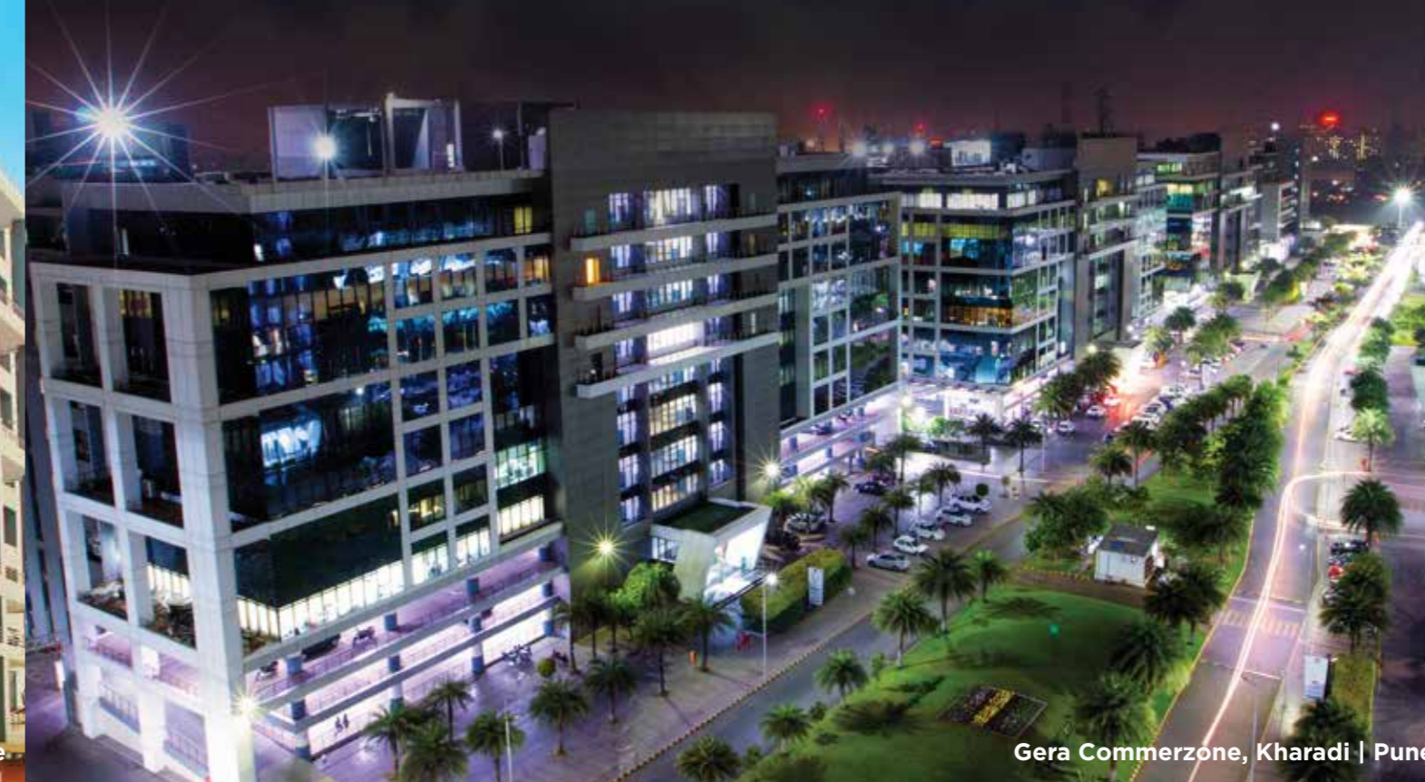
Gera Commerzone, Kharadi | Pune