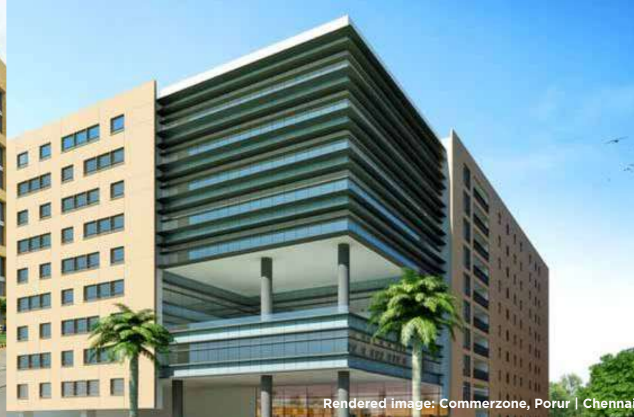
Rendered image: Commerzone, Porur | Chennai