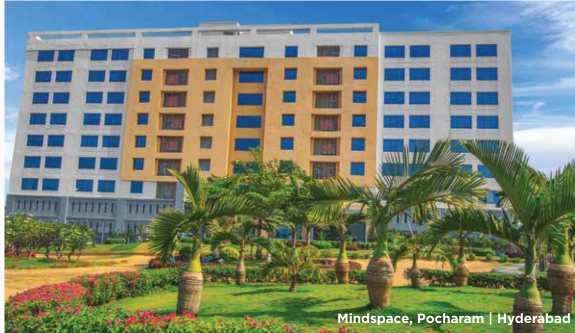
Mindspace, Pocharam | Hyderabad