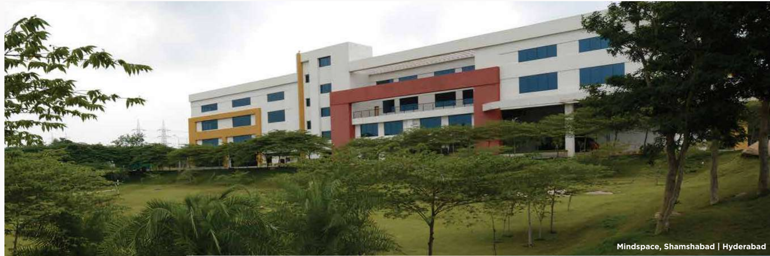
Mindspace, Shamshabad | Hyderabad