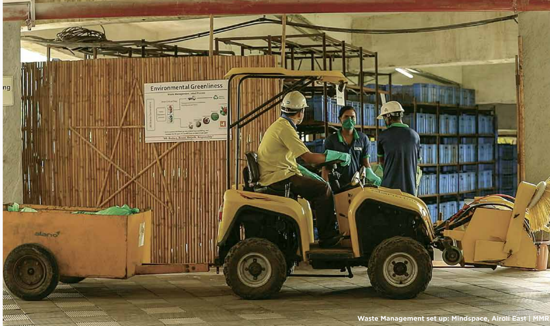
Waste Management set up: Mindspace, Airoli East | MMR