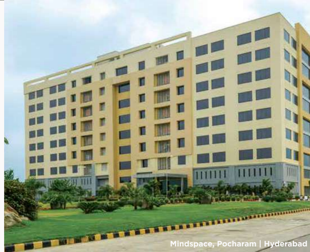
Mindspace, Pocharam | Hyderabad