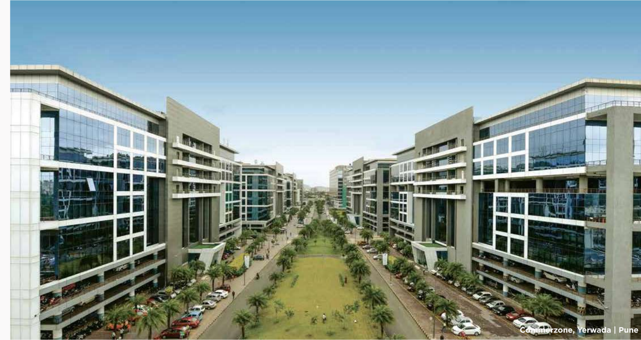
Comarzone, Yerwada | Pune